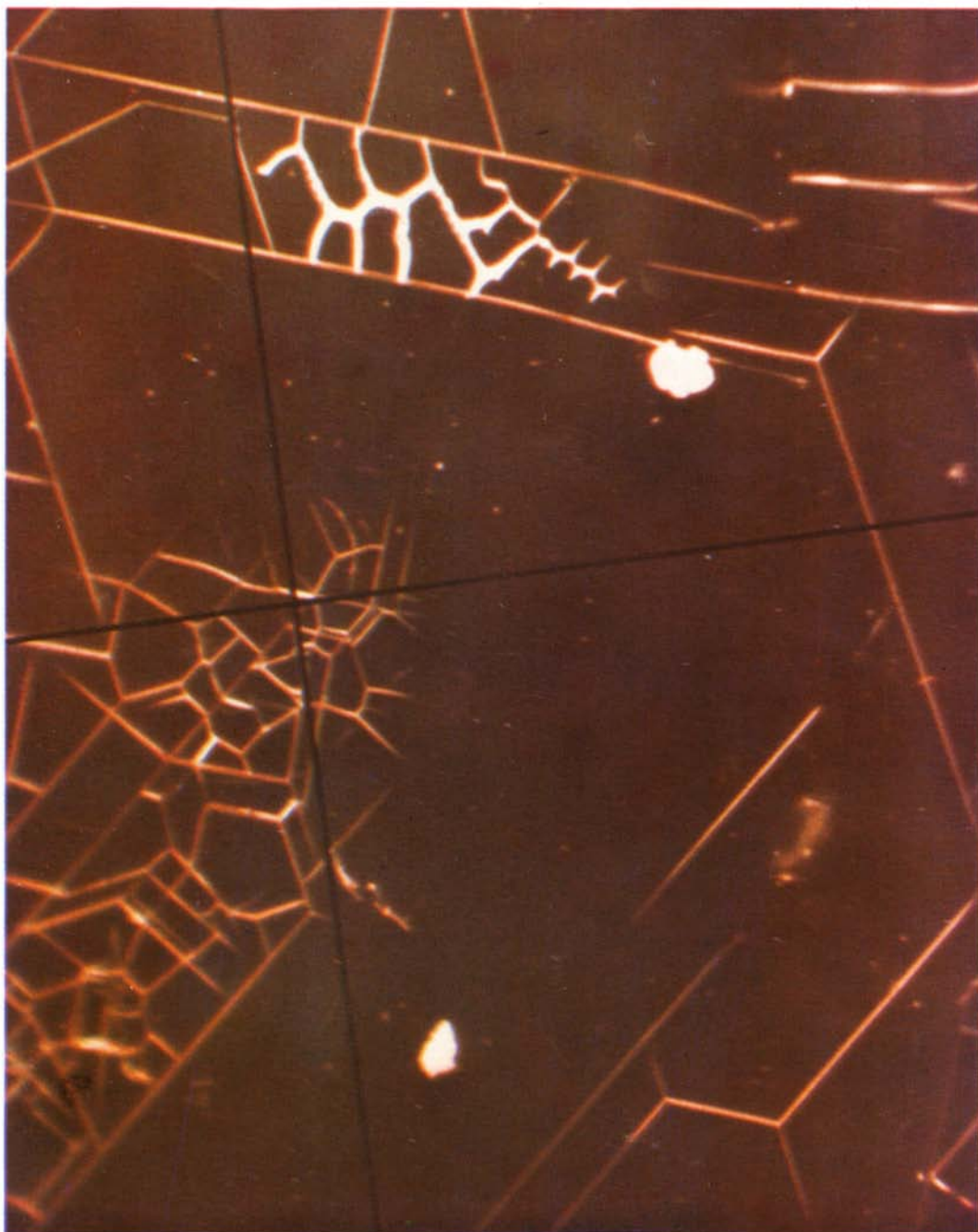
FIG. 2. Cracking in TiS 2 crystal; 45° illumination. Magnification approximately 250×. One inch is approximately 100 μm.